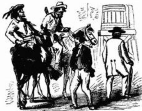
According to their Sympathies.

"Come here Dave!" halloed Secesh. "Here's a Butternut. Just come and look at him. Look here, old man, where do you live? We want what horses you have got to spare, and if you have got any greenbacks, just shell 'em out!" and they took all he had.