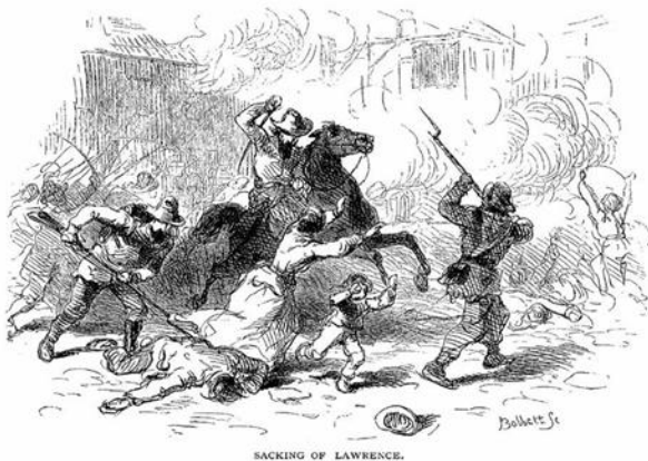
SACKING OF LAWRENCE.

Other bands of Confederates, under various leaders, roamed over the western borders of Arkansas, and, at one time, seriously menaced Fort Blunt, in the Indian Territory. There was a sharp engagement at Honey Springs, in that Territory, on the 17th of July, between Nationals under General Blunt and Confederates in strong force led by General Cooper, in which the latter were defeated, and a part of them fled into northern Texas. Guerrilla bands in Blunt's rear did much mischief. One of them, led by a white savage named Quantrell, fell upon the defenceless town of Lawrence, in Kansas, on the 13th of August, and murdered one hundred and forty of the inhabitants. They also laid one hundred and eighty-five buildings in ashes and escaped.